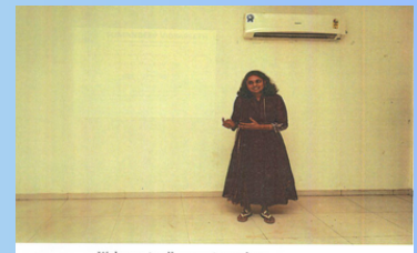
Welcome to all present member